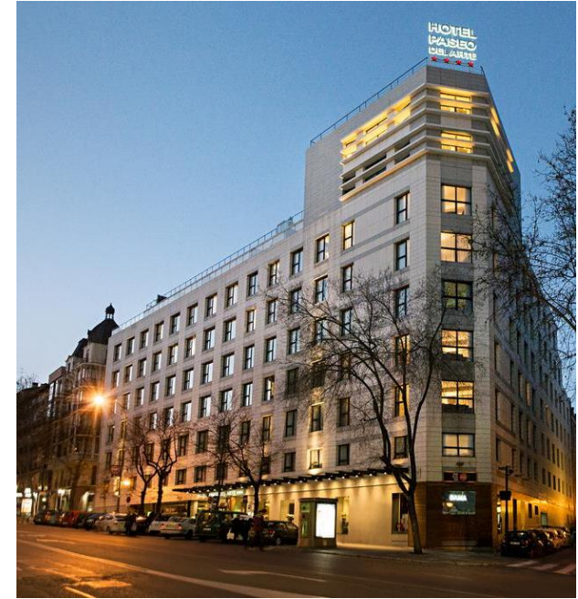
Prime location close to Museo del Prado