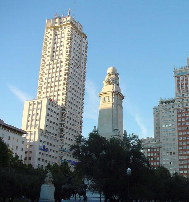
Prime location in Plaza de España